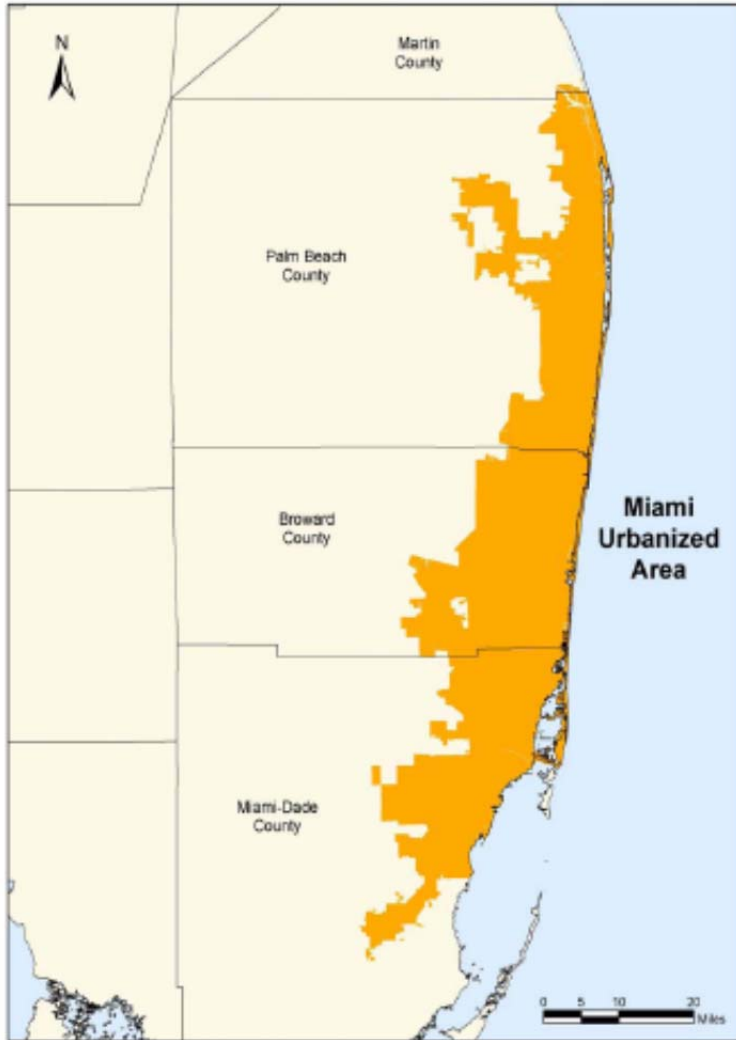
Map 1: Study Area